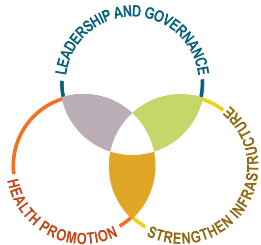
Required Areas of Work (Population Health Activities)

The LPHS contract was redesigned in FY23 to initiate the dedicated use of LPHS funds towards the Public Health System with three required areas of work. The required areas of work are leadership and governance; health promotion; and strengthening local public health infrastructure. In FY25, the contract continued to support and build upon this framework, emphasizing sustained efforts in these core areas to improve local public health systems across the state.