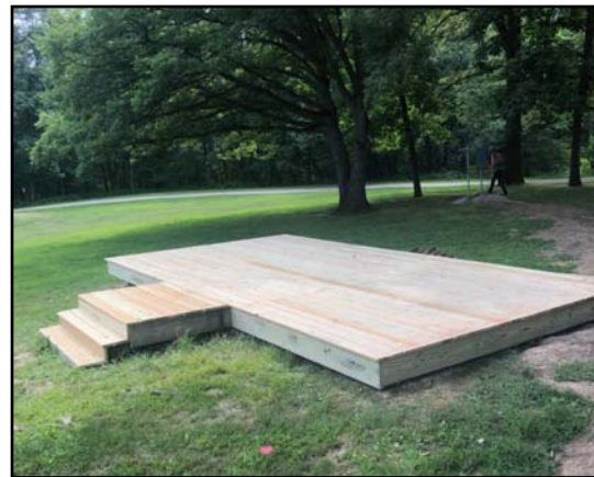
Above: The stage at Ashton Park has expanded in size and now has electricity available.

There is also a new water bottle refill station at the restroom/shower house building for park visitors to use. If you haven't been to Ashton Wildwood Park in a while, you should plan to visit and see all the new updates! We hope to see you soon!