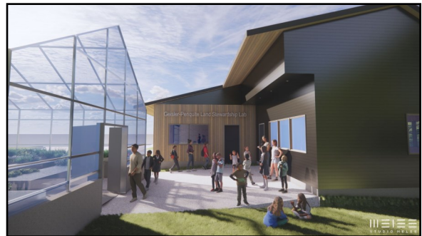
Above: Architect's rendition of the Geisler-Penquite Land Stewardship Lab.