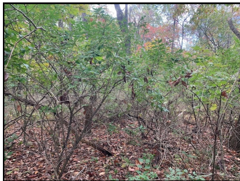
Top: Goats are an effective tool for removing invasive brush in a timber. Bottom: Bush honeysuckle can quickly overtake native wildflowers and other plants on the forest floor.