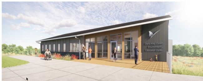
DANA KING CERETTI ENVIRONMENTAL EDUCATION CENTER