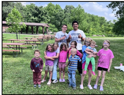
Left: Volunteers gave picnic tables a fresh coat of paint at Jacob Krumm Preserve.

Lastly, picnic tables got a fresh coat of paint, thanks to youth volunteers from The Church of Jesus Christ of Latter Day Saints led by Micaela Scott. They look fantastic and are ready for use this summer!