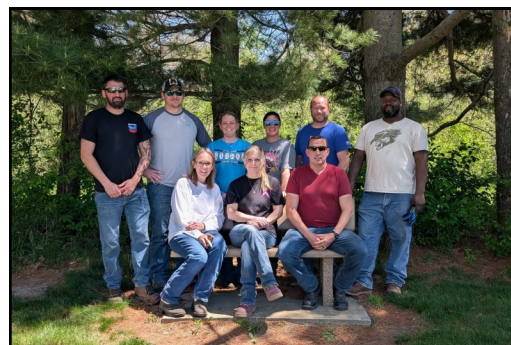
Above: Staff from Chevron Renewable Energy volunteering at Ashton Park.

Employees from Chevron Renewable Energy Group volunteered two full days with Jasper County Conservation this spring! The staff spent a day at Ashton Wildwood Park and a day at Mariposa Park, clearing invasive brush. Thank you so much to Chevron for your dedication to our community and the environment!