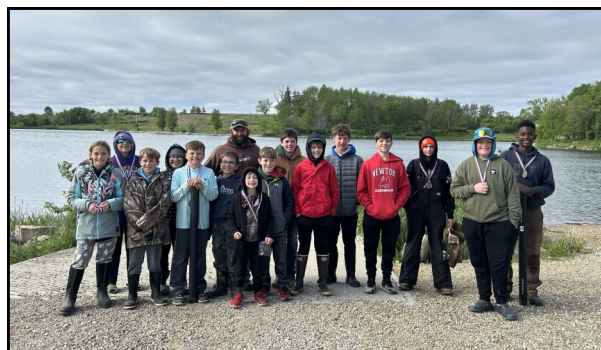
Above: Jasper County's Youth Fishing Club after a tournament at Mariposa Recreation Area this past spring.