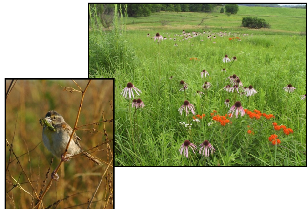
Above, Right: Pale Purple Coneflowers and orange Butterfly Milkweed in bloom in the prairie.