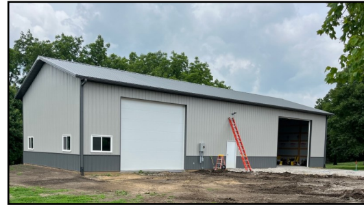
Above: The new shop building is getting some finishing touches before completion at Krumm Preserve.

Located on the east side of the preserve is the Sugar Shack, where maple tree sap is boiled into syrup in late winter. You can also stop at the Waldo Walker Bird Blind, built in memory of an avid hiker and bird watcher from the area!