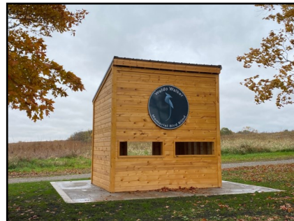
Left: The Waldo Walker bird blind is a great spot to watch birds at the feeders.

Jacob Krumm Nature Preserve has been featured in several Iowa hiking and park guides, and we are very proud of all the recent improvements. Get out and enjoy your county parks this summer!