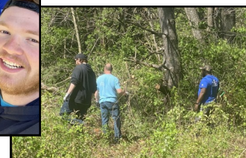
Left and Below: Staff from Chevron Renewable Energy volunteering at Mariposa Park.