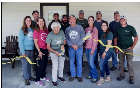
Above: Jasper County Conservation staff and board members at the Mariposa campground and cottage ribbon cutting.

The new, modern-style campground sites are available to rent today for $25 per day for a minimum of two days. The cabin is available to rent for $175 per day for a minimum of two days. Visit www.mycountyparks.com to book a stay at the new camping facilities in Jasper County.