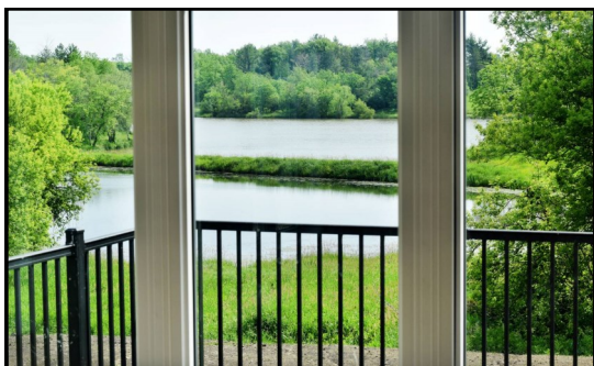
Above: The view of Mariposa Park's pond and lake from Coneflower Cottage .

"I'm happy with the outcome and it's kind of been what my job has been here lately," Vander Pol said. "Because we did the whole campground and that shower building, too. This whole project started with the campground probably a year ago; it's when we first started doing the dirt work for that."