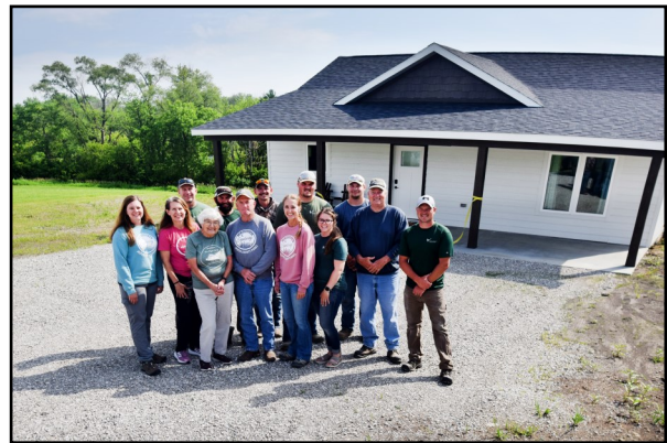
Above: Conservation staff and board members stand in front of Coneflower Cottage at Mariposa Park.

Of course the other new addition is a furnished rental cabin with two bedrooms, one bathroom, a full kitchen and a back deck with one of the best views in the park. Conservation contracted out the foundation and insulation work, as well as the utilities installation, but it was otherwise fully